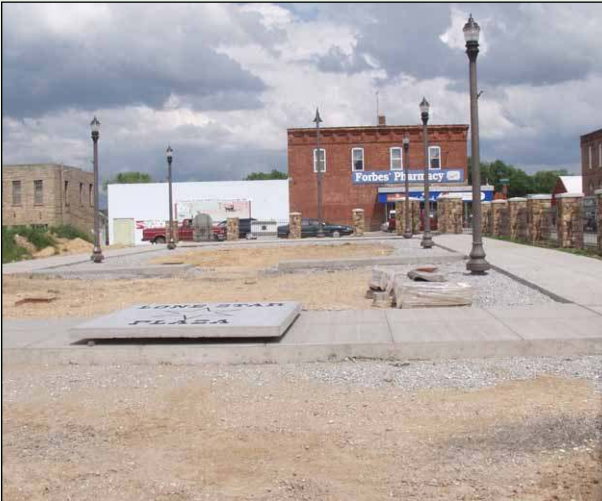
A fire-damaged block is transformed into the Lone Star Plaza.