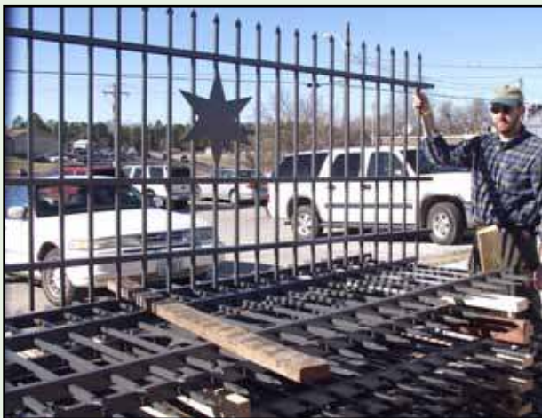
A wrought iron fence is installed at the plaza, left. At right, rock work is completed.