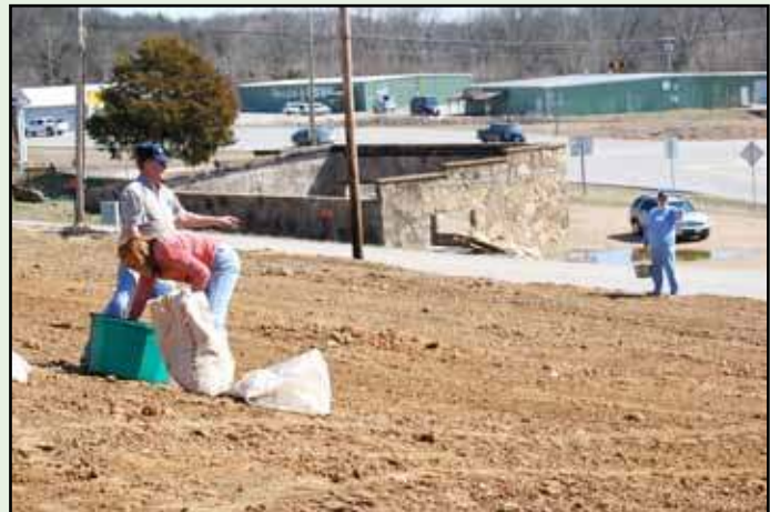
The wildflower project. In the background is the former Haney Market.

A walking trail's trail-head is situated at what once was the redi-mix plant.