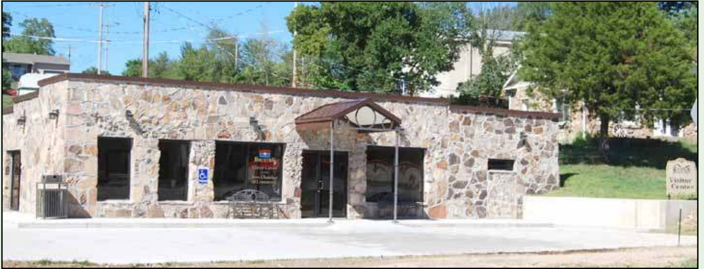
The Haney Market as the project started