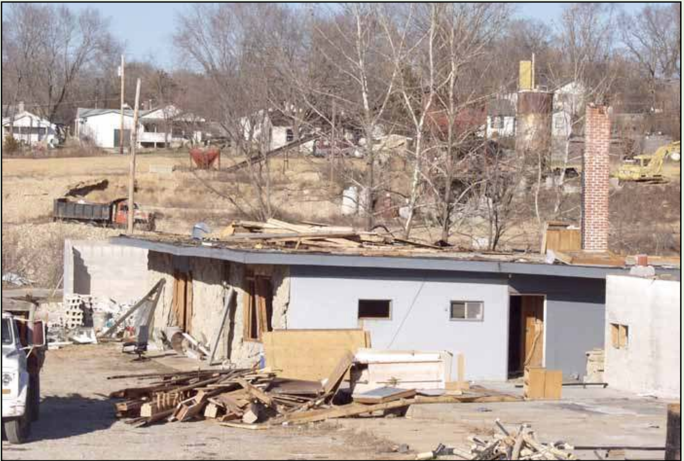
The Houston Redi-Mix plant is in the background. In the foreground, apartments are demolished thanks to a City of Houston project.