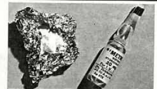
Wednesday's arrests stemmed from primarily the sale of methamphetamine in the county. Here, the illegal drug.

Nicknamed "meth," "crank" and "speed," methamphetamine is as addictive as cocaine but more available. Locally, lawman said a habit can cost thousands of dollars. The drug is expensive.