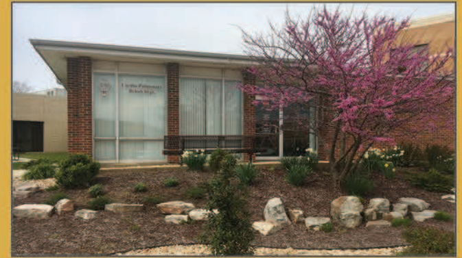
Cardiopulmonary Rehabilitation Clinic